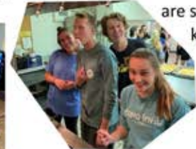
← Lock-In Game: Hungry, Hungry, Hippo