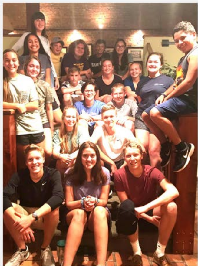
↑ CYF (High School Youth Group)