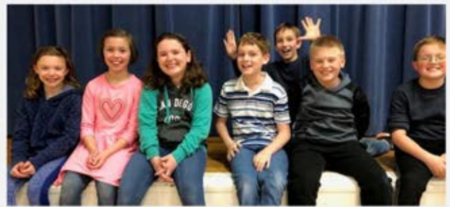
The Junior Youth Fellowship pictured last Sunday, March 18. A dynamic group of young disciples!