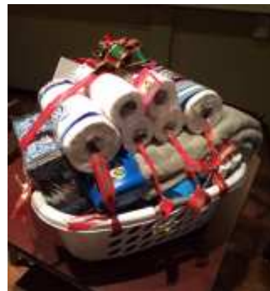
Two scenes from December

The grocery basket was full of canned goods – they came Pageant night wrapped as the white gift offering along with $500 in monetary gifts given to the Central Missouri Food Pantry. The Voluntary Action Center’s adopt a family project was a great connection for FCC again this year. With 50 families cared for we had a bus and truck load to deliver in early December. Pictured is a great example of the gift giver who wins the award for doing it right. EVERY gift in the basket was secured and ready for transport – a FULL basket and not one thing fell out. A note to other gift givers — thank you all! -- but next year refrain from the little plastic Walmart sacks...they don’t move, transport, or hold things well. Volunteers fight those sacks over and over. Next year the Church in Society Department will be proactive in helping gift givers drop off in a “labeled and ready to transport fashion.”