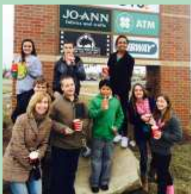
(Chi-Rho groupers after lunch last Sun.)

Jan 18 no CC (Holiday) Jan 25 4:30-5:30 (Chi Rho Sunday)