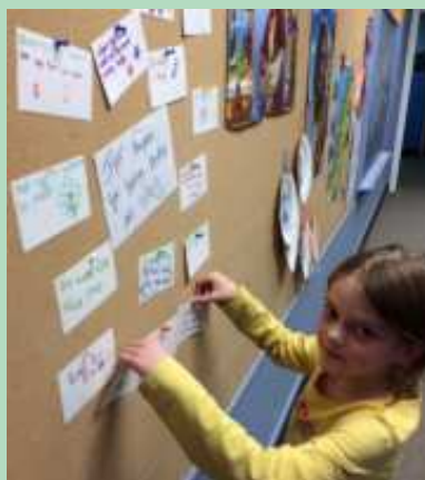
Scenes from JYF last Sunday -- as the group took part in a Lenten prayer experience