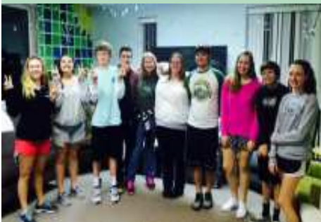
CYF - youth group for high school FCCers